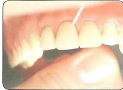
Superflossing a bridge